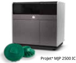
Projet* MJP 2500 IC

Building productivity and new manufacturing efficiencies with tool-less 3D printed casting pattern production from 3D Systems