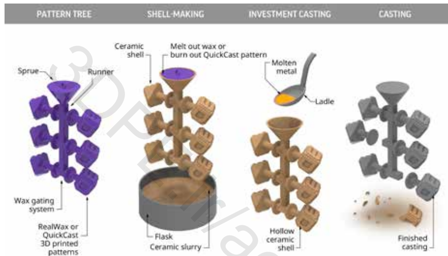
3D printed patterns are burned out into the lost wax or shell investment casting process