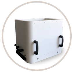
Stratasys H350 build removal box