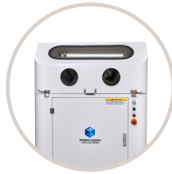
Powder retrieval station

Solution for Stratasys H350 printer or your choice