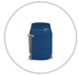
Stratasys H350 powder container